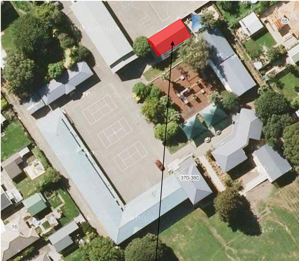
Block 3 (Library)

During the course of the yet to be completed detailed engineering evaluation (DEE) of Our Lady of Fatima School, the structural engineers from Opus International Consultants have determined Block 3 (Library) to be earthquake prone. This building therefore requires strengthening work in order to meet appropriate building standards.