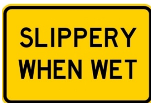
Slippery when wet supplementary sign.