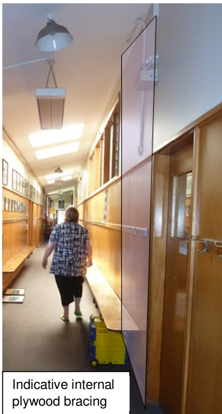
Indicative internal plywood bracing

Remove Brick Columns & brace with plywood